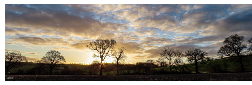
Sunrise - by Estelle Siegers Helsen of Waltham. See www.newtraces.uk

Retrospective submission for the erection of two solar panel arrays, containing seventy six panels.